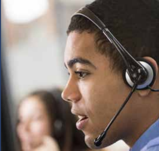
The Servicedesk asks whether they can be of further assistance. The telephone conversation is concluded and noted in the customer system.

We have received your pension request and will deal with it. You will receive a confirmation from us.